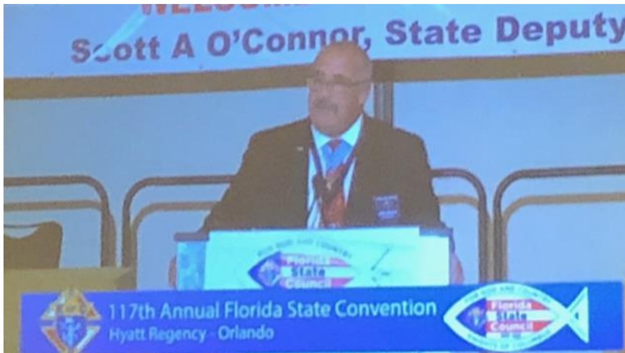
Photo was taken off the screen in the Convention room.